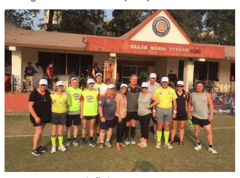
India January 2017.