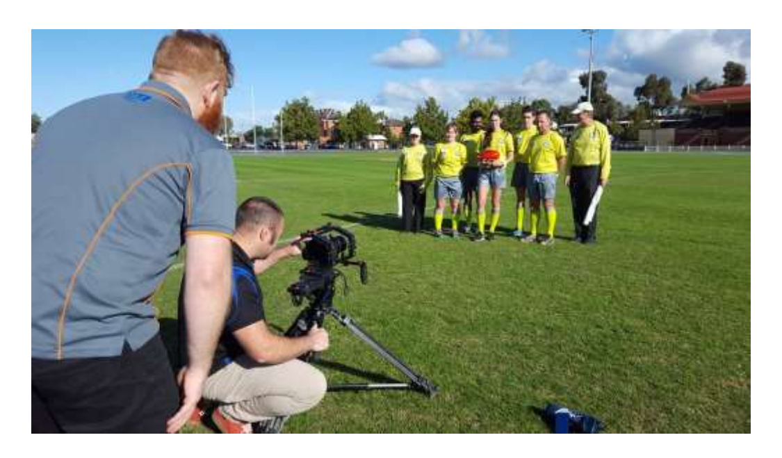
Filming a television commercial for Triple MMM and the BUA.

For everyone at North Central, Loddon Valley and BJFL umpires, we can't do this without you, everyone is important at this club and we want everyone to enjoy what we do. Thank you for all the travelling and all the time you have committed to the sport.